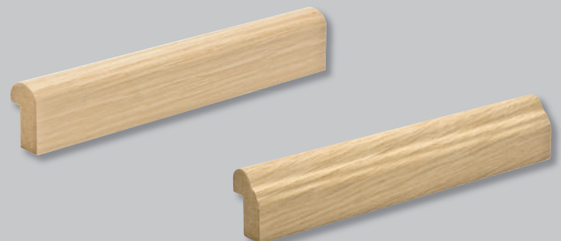
Rounded & Moulded Hockey Sticks