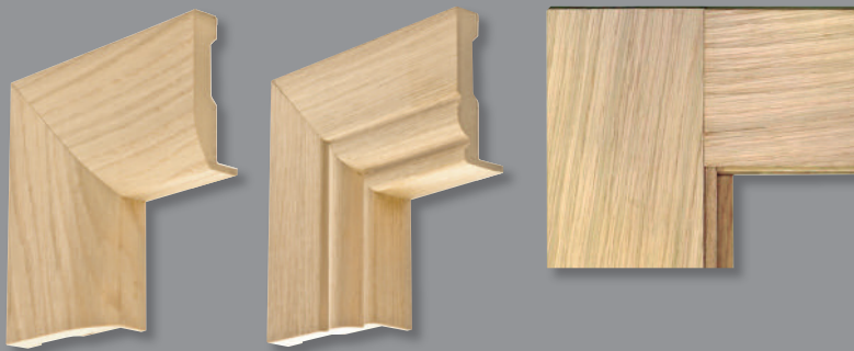
Flexi-Fit Adjustable Rounded, Moulded and Square Architraves. Available in 69mm and 94mm